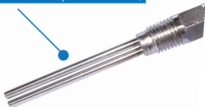
RTD's (Resistance Temperature Detectors)