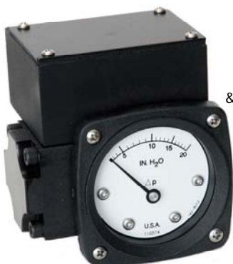
Model 142 with 2-1/2" Dial & 4-20mA Transmitter

“A World Leader in Differential Pressure Gauges, Switches & Transmitters