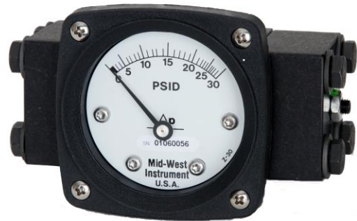
Model 140 0-30 PSID with 2-1/2" Dial

“A World Leader in Differential Pressure Gauges, Switches & Transmitters