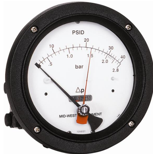
Model 140 0-40 PSID & 0-2.8 Bar with 4-1/2" Dial & maximum follower pointer