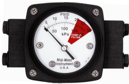
Model 140 0-30 PSID & 0-200 kPa with 2-1/2" Dial & Special Color Dial