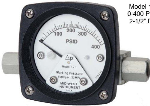
Model 123 0-400 PSID 2-1/2" Dial

A low cost differential pressure gauge for use in measuring the pressure drop across filters, strainers, separators, valves, pumps, chillers, etc., and for local flow indication and control.