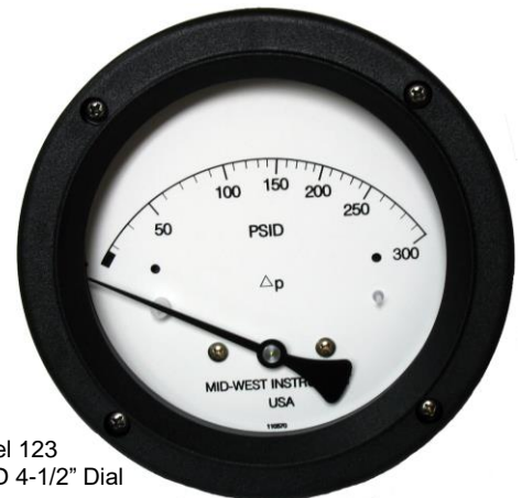
Model 123 0-300 PSID 4-1/2" Dial

An optional maximum indication follower pointer provides automatic indication of maximum differential occurring during a time period or system cycle. Reversed pressure ports are optionally available to facilitate installation and readability depending on which side of a filter, etc., the instrument must be installed.