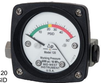
Model 120 0-50 PSID With Special 3 Color Dial

An optional maximum indication follower pointer provides automatic indication of maximum differential occurring during a time period or system cycle. Reversed pressure ports are optionally available to facilitate installation and readability depending on which side of a filter, etc., the instrument must be installed.