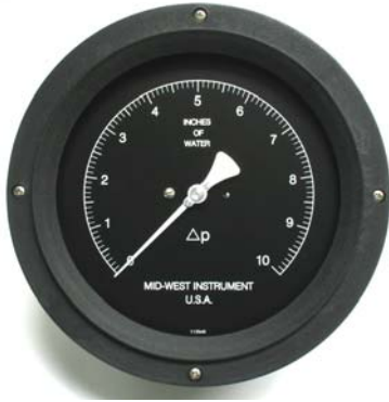
0-10" H 2 O Single Scale