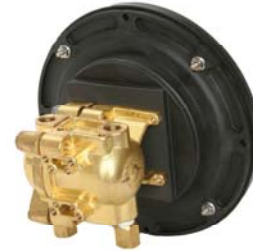
Model 116 Cast Brass Body