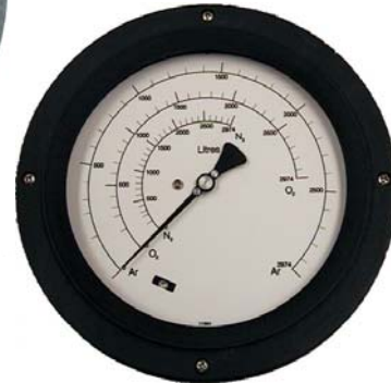
Ar, O 2 , N 2 Tri-Scale Dial