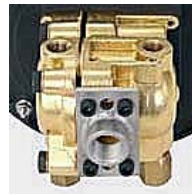
Optional 3/4" FNPT Stub Mount Shown Shown on Model 116