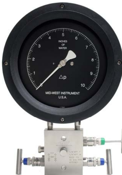
Model 115 shown with Optional model 107467 S.S. Direct Mount 3-Valve manifold with pressure gauge port

Model 116 can be equipped with one or two independently adjustable SPDT snap acting Micro-Switches which can be set on decreasing or on increasing pressure. A switch adjustment screw and a switch lock screw is accessible after removal of the lens and bezel (removal of 4 screws). Interface to the snap acting micro-switch is via color coded 18 AWG flying leads and a ½’ FNPT conduit connection. Model 116 with switch temperature limits are rated at -20°C to +185°F