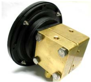
Model 115 Brass Body