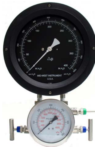
Model 116 shown with Optional model 107467 S.S. Direct Mount 3-Valve manifold with (Customer supplied) pressure gauge