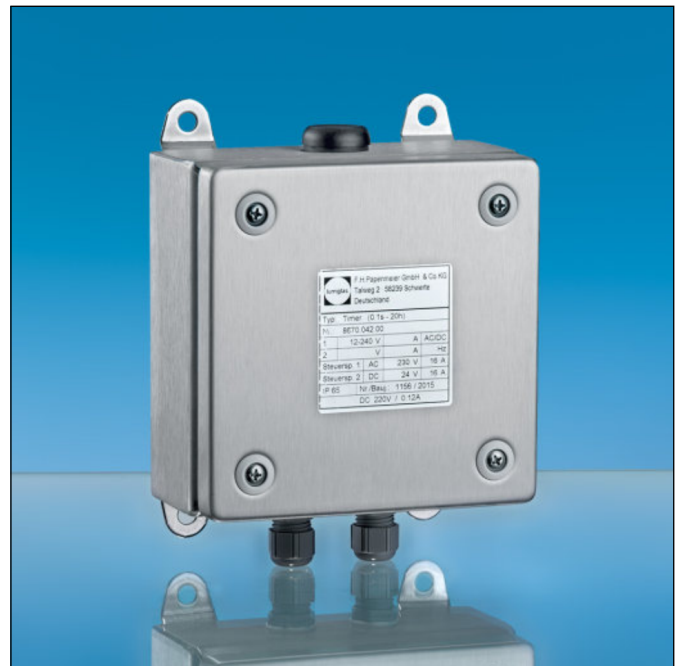
Lumistar Timer, stainless steel version