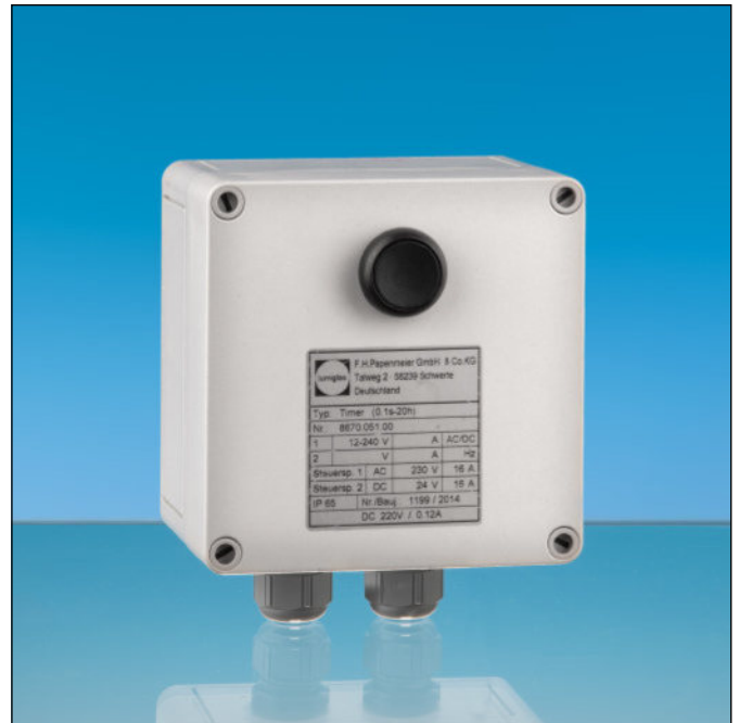
Lumistar Timer in synthetic housing