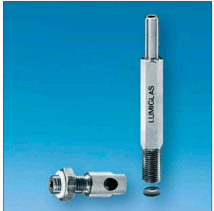
Lumiglas spray device