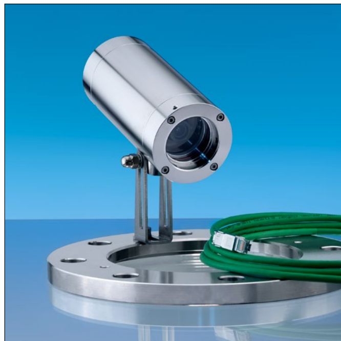
VISULEX camera K55-HD-Ex mounted on a flange with a hinged bracket