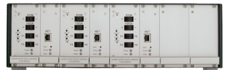
6-camera rack equipped with three camera modules and three video servers