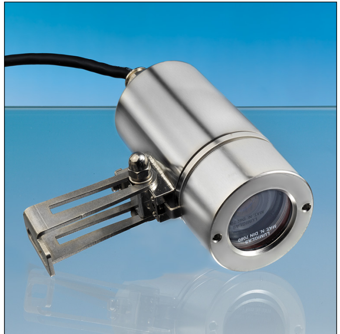
VISULEX Ex-camera K25ZP-Ex with zoom lens