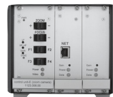
Single-camera rack with video server