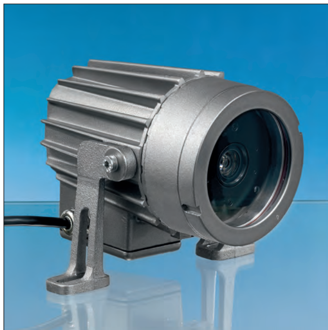
Lumiglas VISULEX K 07-Ex camera with zoom lens