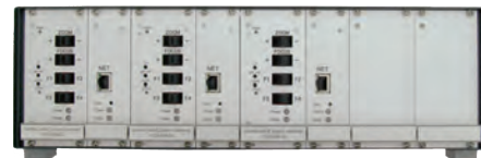
6-camera rack equipped with three camera modules and three video servers