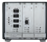
Single-camera rack with video server