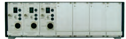
6-camera rack equipped with three camera modules