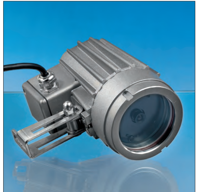
Lumiglas VISULEX K 06-Ex camera with fixed lens