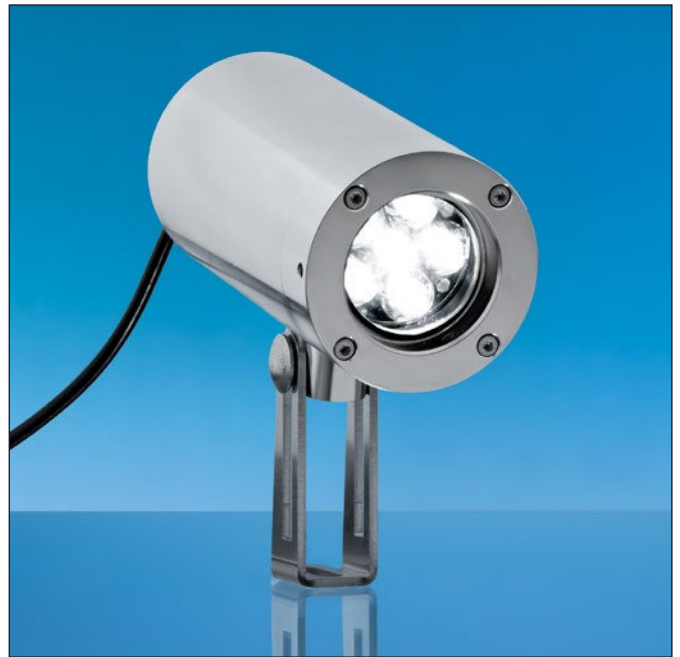
Lumistar luminaire ESL55LED-Ex