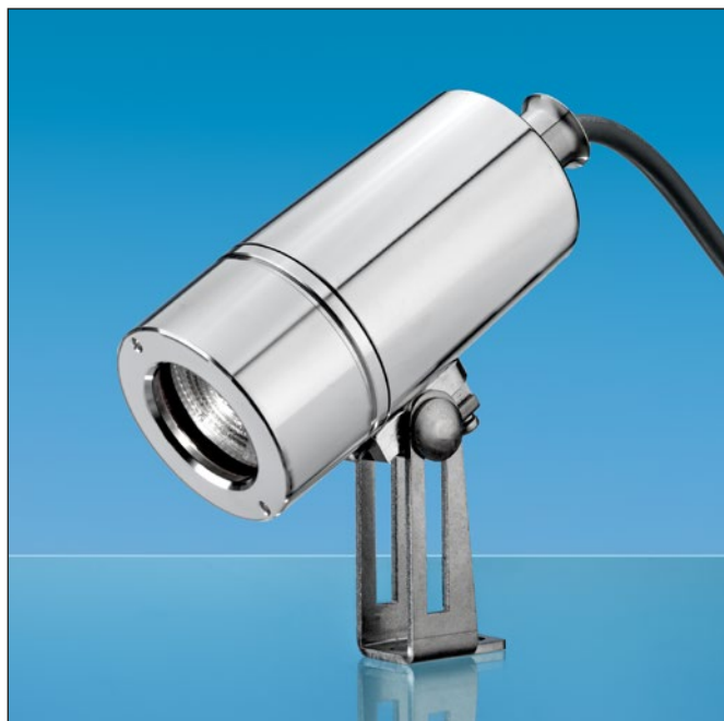
Lumistar luminaire ESL 25LED