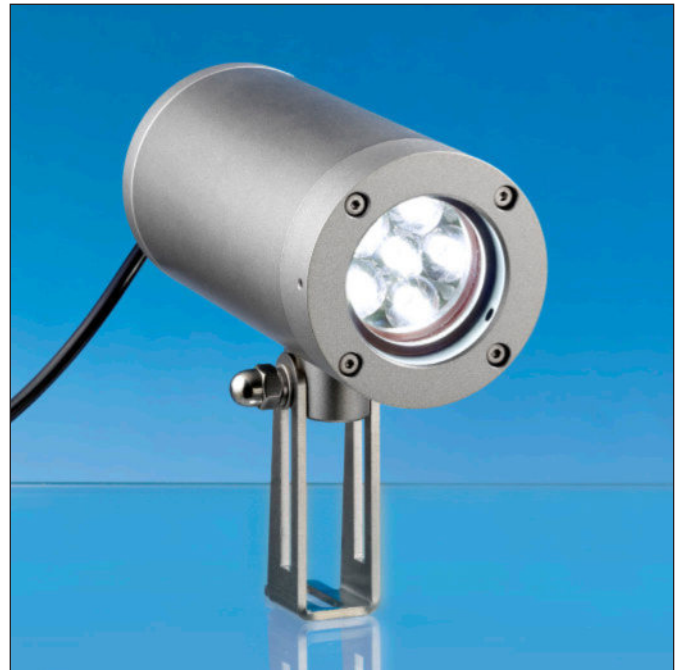
Lumistar luminaire ASL55LED-Ex