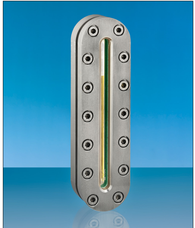
Complete assembly of a Lumiglas oblong oval sight glass fitting